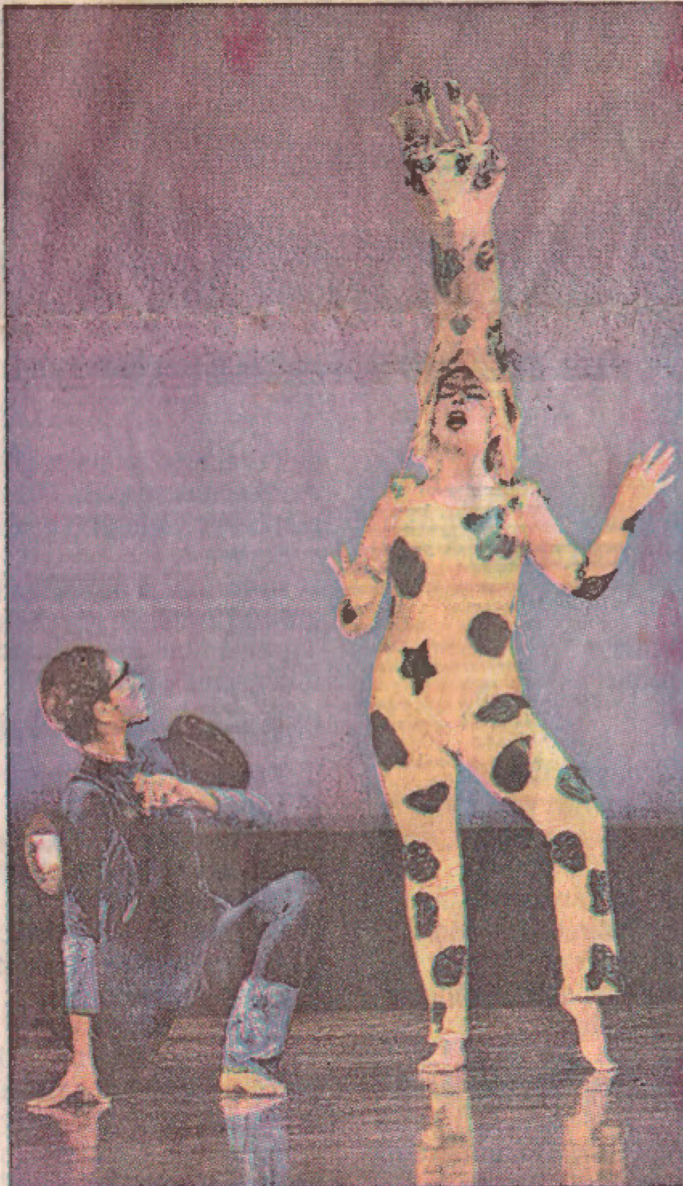
Members of Grosso Modo dance during a free performance Saturday at the Knickerbocker Theatre in Holland.

Grosso Modo's visit is part of the first performing arts cultural exchange between Holland and its sister city of Queretaro, Mexico.